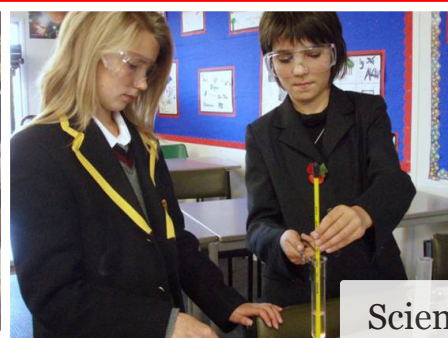
Science & Drama