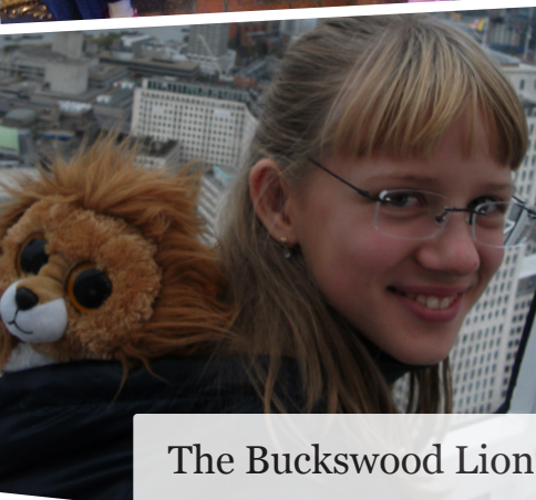
The Buckswood Lion