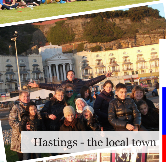
Hastings - the local town